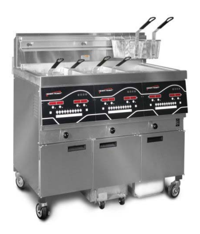
EEG 243 3-well gas open fryer